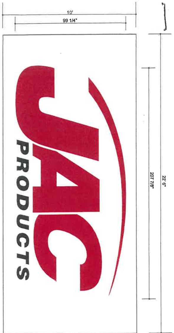
Front Elevation Scale: 3/8" = 1'-0"